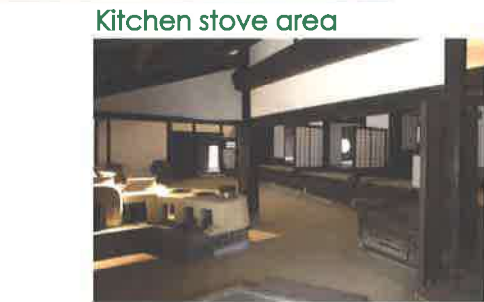
Kitchen stove area