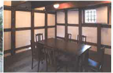
North storehouse (Kita dōzo)

The North storehouse built in 1800, is now used as a gallery and a place to relax.