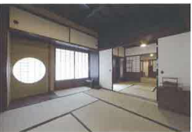
South room (Minami no ma)

The North storehouse built in 1800, is now used as a gallery and a place to relax.